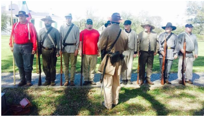
Members of the Shieldsboro Rifles Camp #2263 participated in the first drill for the newly formed 3 rd Miss Inf. Reg. Reenacting Group at Beauvoir during the 3 rd Saturday Living History held on Saturday February 18, 2017.